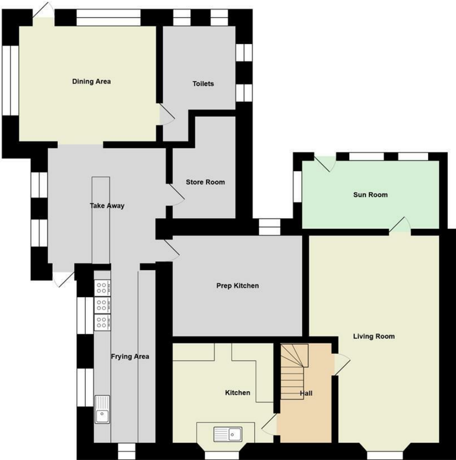
The Galleon and Mounts Bay House Ground Floor